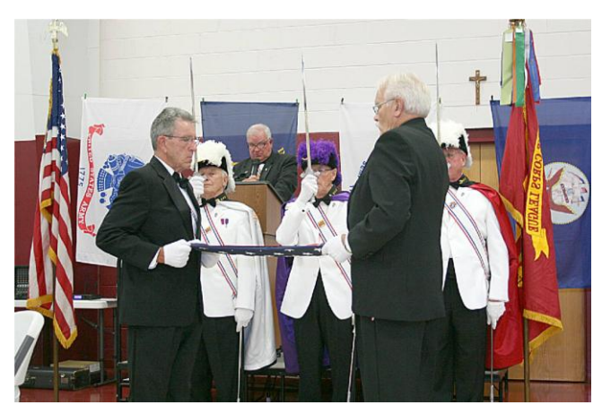
Sir Knights performing Flag Folding Ceremony

With more than 1.8 million members, the Knights of Columbus is the world's largest Catholic lay organization. It provides members and their families with volunteer opportunities in service to the Catholic Church, the community, families, and young people. Knights of Columbus members last year set records by providing more than 70 million hours of charitable service and more than $158 million in donations to charitable causes. During the past decade, the K of C has donated more than $1.4 billion to charity, and provided nearly 640 million hours of volunteer service in support of charitable initiatives.