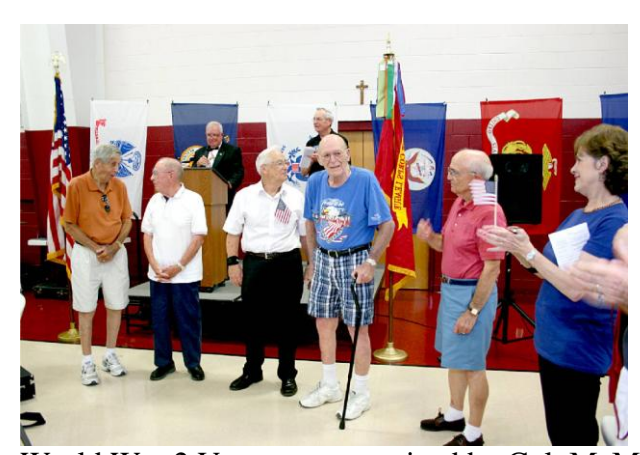
World War 2 Veterans recognized by Col. McMahon